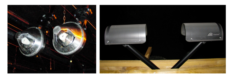
Fig. 1. The two sprayers of the rain simulation system (left) and the spectro-pluviometer (right).

values of these parameters allow producing a total range of rainfall whose intensity varies from 0.2 to 150 mm/h.